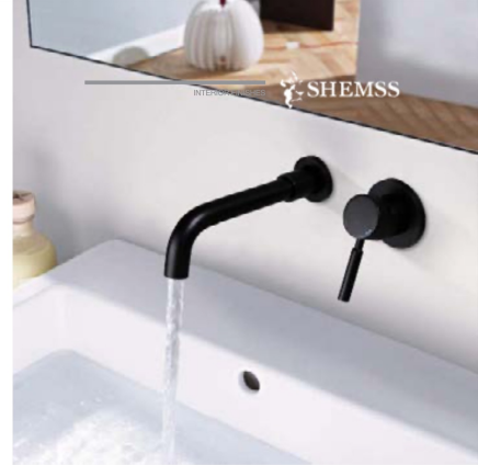
SHEMSS INTERIOR FINISHES

PRODUCT LINKS https://www.amazon.com/gp/product/B07R1XKFF4/ref=asc_inf